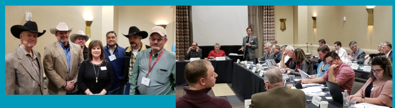
Sheriffs at Board meeting