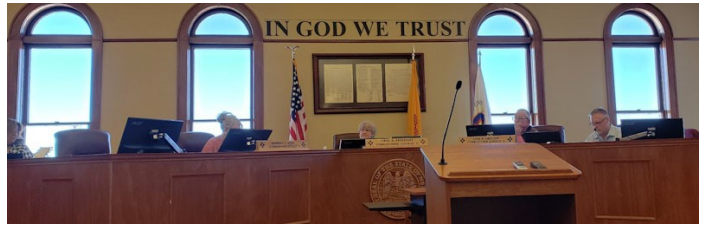
NMC at Luna County Commission meeting 3/14/19

Like and follow us on FB @nmcounties33 www.facebook.com/pg/nmcounties33/posts Post your county happenings on our FB page! Follow us on Twitter @nmcounties33