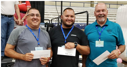
Golf First Place Winners