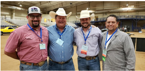
Golf Last Place Winners