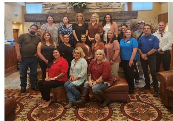
911 Directors Affiliate

Professional Development Conference in Ruidoso Sept. 14-16, 2022. A full day of strategic leadership training, legal updates, DFA/LGD 911 Bureau updates including NM911 training, DPS LEA training, EMS Bureau training, and affiliate initiatives.